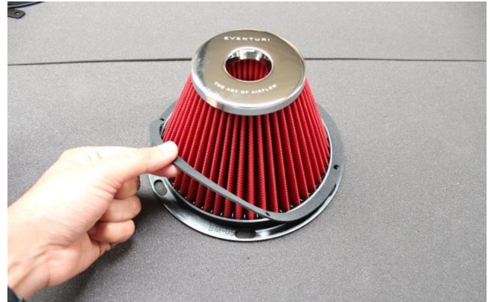
6. Place new gasket around the new filter – line up the holes with the filter holes.