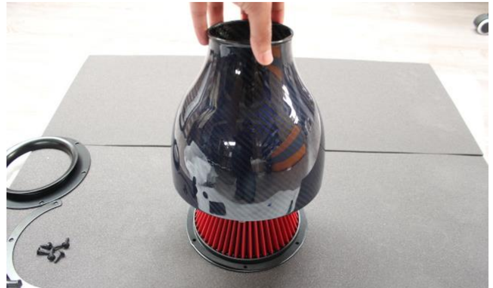
8. Line up and place carbon housing over filter.